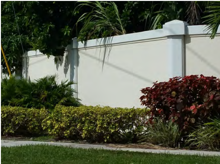
The new walls will follow the design used in 2005 GO project