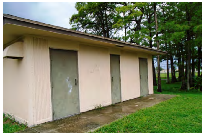
The restrooms at Mullin Park will be renovated as part of this project