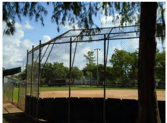
Renovation of baseball fencing and dugouts is planned for Veterans Park