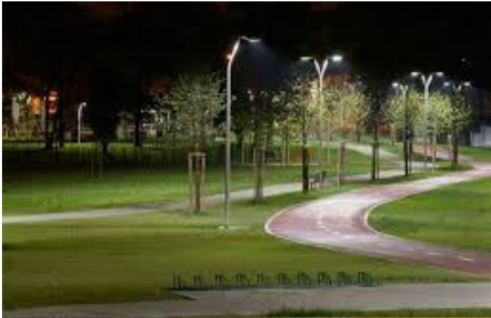
Pedestrian level lighting can supplement street lighting