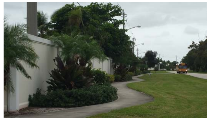
Most local streets with walkways are currently lit only by street lights