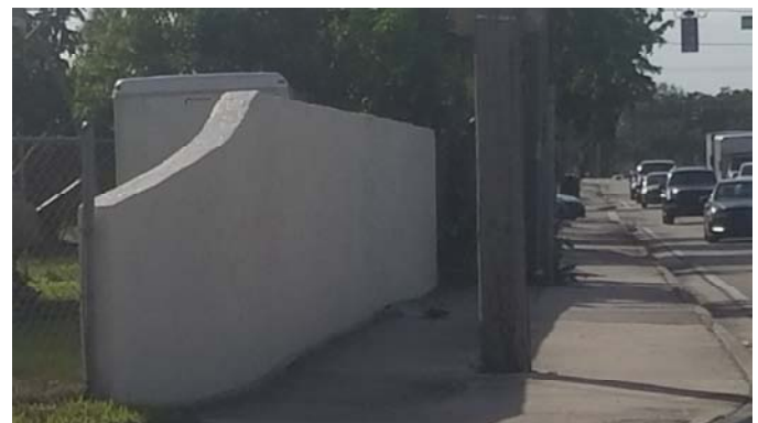
Existing wall at NW 19 St to be replaced at a future date