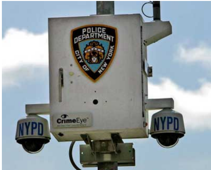
New York and Miami are just two of the many cities that have installed Public Safety surveillance systems