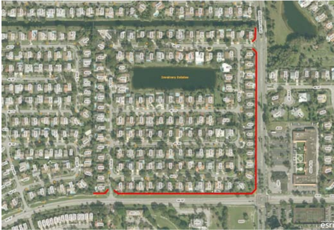
Projected location of walls (in red) along Inverrary Blvd and NW 44 St