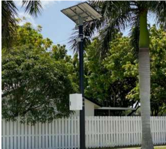
New poles for the cameras and license plate readers can be combined with solar panels for standalone operation