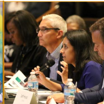
Business Expo & Pitch Competition