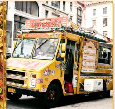
Food Truck Invasions