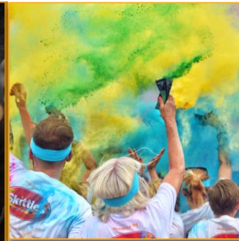
Lauderhill Color Run