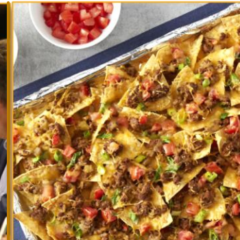
Nacho Average City