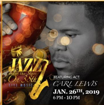
Jazz Under the Stars on 38 th ave