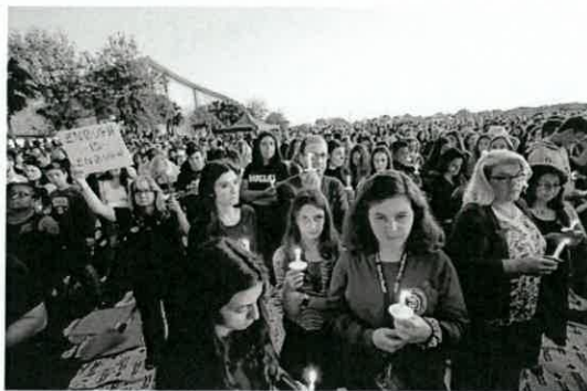
Thousands of mourners held candles during a candlelight vigil for victims of the Marjory Stoneman Douglas High School shooting in Parkland in February 2018.

Florida took a step in the right direction last year, but the state is still not doing enough to meet the